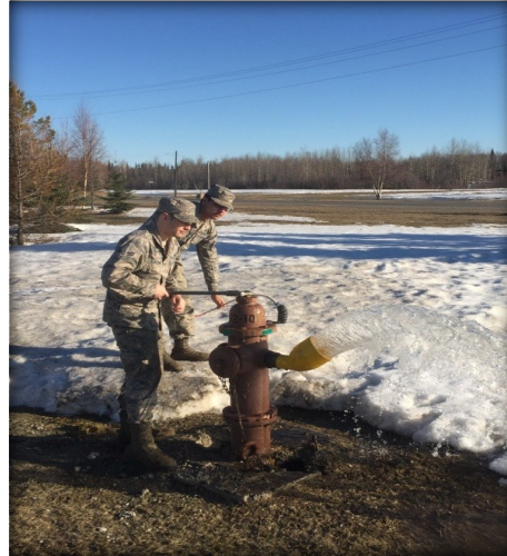
Utilities Maintenance personnel performing routine fire hydrant flushing.