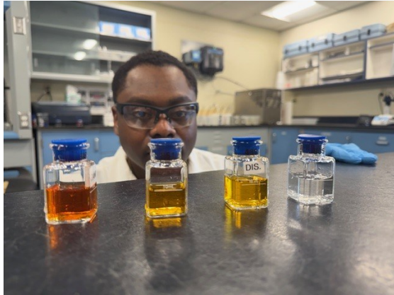
Water Treatment Plant personnel testing the finished water throughout the day.