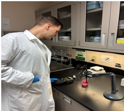
Bioenvironmental Engineering personnel testing the base water weekly at various sites throughout Eielson AFB.

You can have the utmost confidence in the team of professionals from the 354 CES Water Treatment Plant, 354 CES Utilities Maintenance, and 354 MDG Bioenvironmental Engineering who are dedicated and committed to providing Eielson AFB with clean safe water.